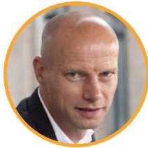
HENK OVINK Special Envoy on International Water Affairs, Kingdom of the Netherlands