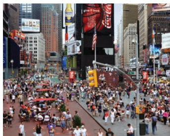
New York City (2012)