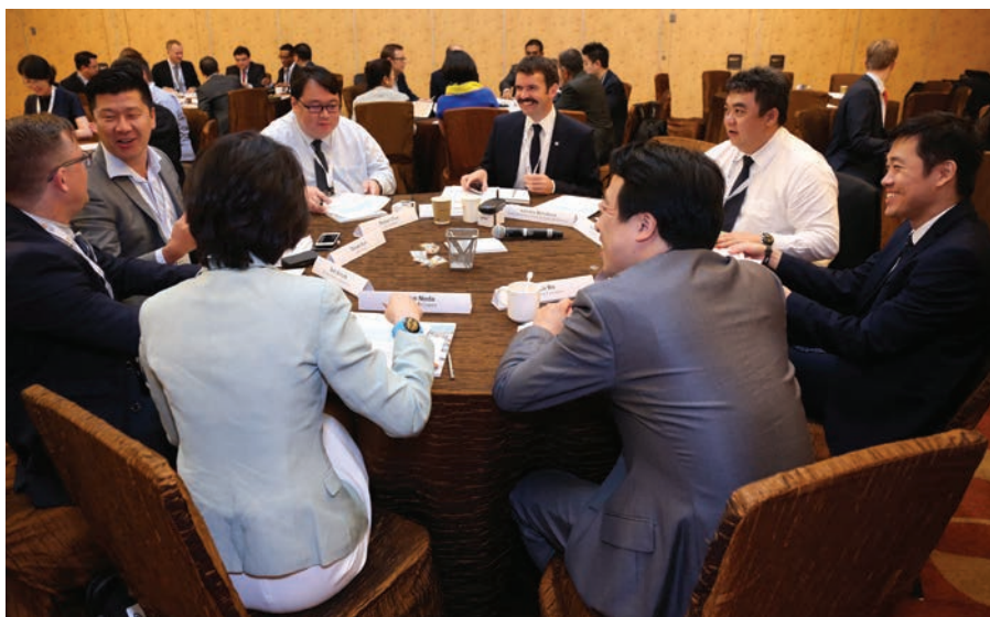
The World Cities Summit Young Leaders in discussion at the 2016 symposium

Under the overarching theme of the World Cities Summit, the Symposium this year will focus on innovation and disruption in the public, private and people sectors. Our Young Leaders will explore how cities and industries can harness new innovations to tackle perennial challenges as well as new ones. Starting with the Young Leaders' Pitch, the Young Leaders will share what innovation means to them, the associated challenges, and the solutions they have in mind. This will be followed by three rounds of group discussions to deep dive into the ideas presented from various interdisciplinary angles, and to shape these ideas into concrete plans and projects. The discussions and concluding thoughts from the Symposium will be shared at the World Cities Summit Mayors Forum by a representative.