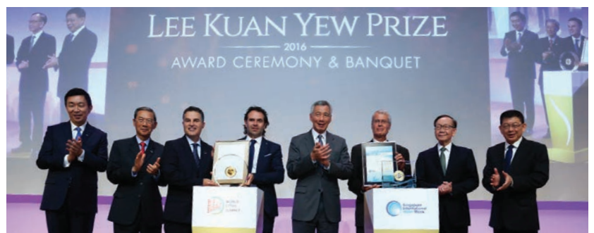
The Lee Kuan Yew Prize Award Ceremony & Banquet in 2016

The award ceremony and banquet will be held at The Ritz-Carlton, Millenia Singapore on the evening of Monday, 9 July 2018.