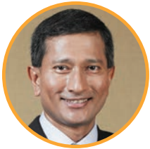
DR VIVIAN BALAKRISHNAN Minister for Foreign Affairs and Minister-in-Charge of the Smart Nation Initiative, Singapore