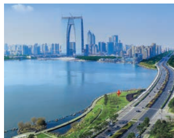
Suzhou, Jiangsu Province (2014)